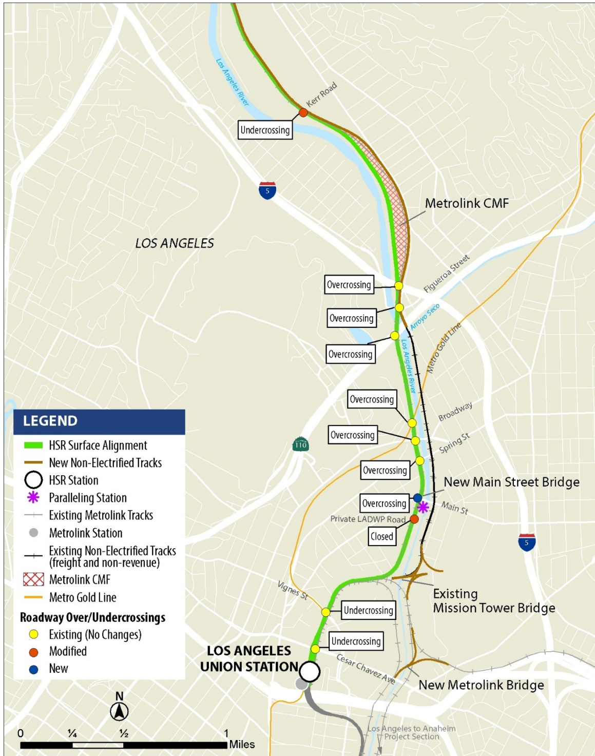
Figure 3 Burbank to Los Angeles Project Section—Los Angeles Union Station