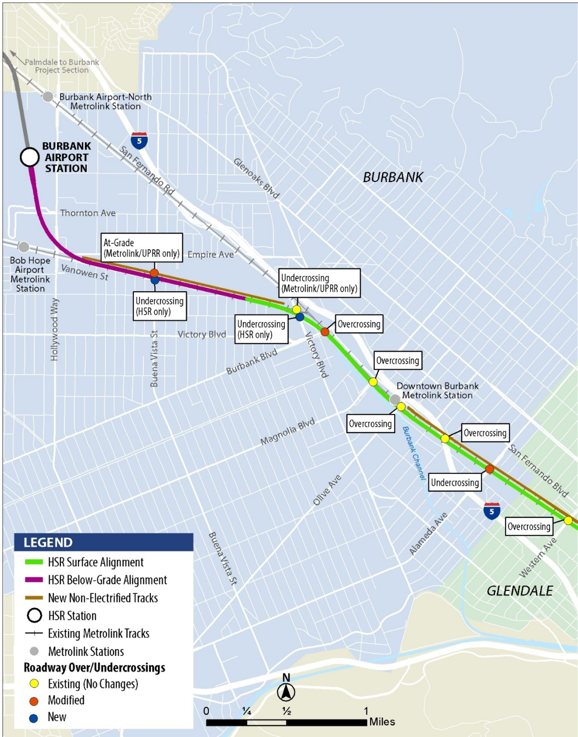
Figure 2 Burbank to Los Angeles Project Section—Burbank Airport Station