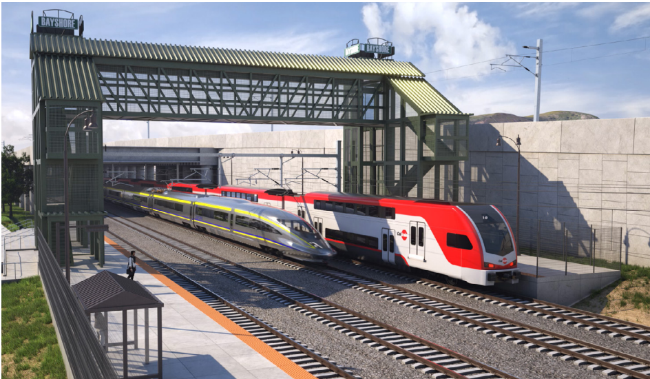
Rendering of high-speed rail and Caltrain operating at Bayshore Station

High-speed rail will transform and modernize passenger rail in Northern California by electrifying existing rail and connecting the state's regional economies like never before.