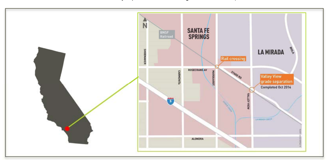
Figure 1: RM Grade Separation Project Location (source: Rosecrans/Marquardt Grade Separation Project Community Open House Meeting, March 1, 2016)

The intersection of Rosecrans and Marquardt Avenues is currently an at-grade rail crossing on the Los Angeles to Anaheim corridor. The RM Grade Separation Project is intended to provide a new vehicle overpass at the intersection of Rosecrans and Marquardt Avenues to enable automobile traffic to travel over the rail corridor and provide unencumbered operations to the current passenger rail, current freight rail, and planned future high-speed rail operations. A more detailed project description is provided in Section 1.2.