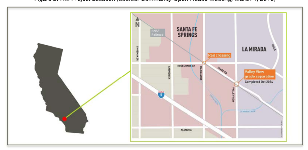
Figure 2: RM Project Location

The RM Grade Separation Project is located in Santa Fe Springs, CA between Los Angeles Union Station and the Anaheim Regional Transportation Intermodal Center (Figure 2). The RM Grade Separation Project site is currently an at grade rail crossing at the intersection of Rosecrans Ave and Marquardt Ave. The railway corridor through the Rosecrans/Marquardt intersection is owned by BNSF and it serves approximately 60 freight trains and 52 passenger trains per day in addition to roughly 45,000-52,000 vehicles per day<sup>2</sup>.