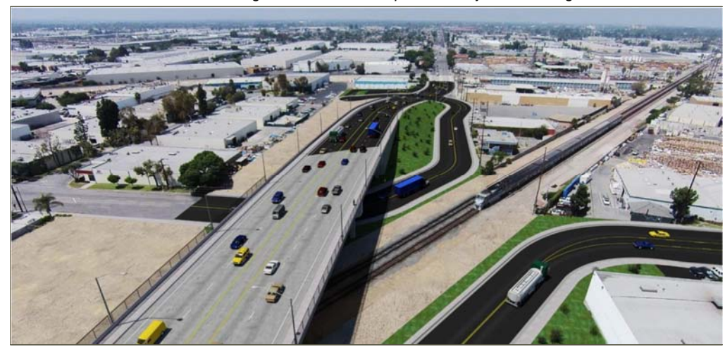
Figure 3: RM Grade Separation Project Rendering

The overpass will raise Rosecrans Avenue over the existing railway and Marquardt Avenue. Marquardt Ave will no longer pass through the railway, and will go over the Rosecrans overpass via the connector roads (Figure 4). The completed RM Grade Separation Project will provide a grade separated crossing at the Rosecrans/Marquardt intersection. The project is currently at a 65% design which was completed in November 2016. The final 100% design is anticipated to be complete in February 2018. Metro is currently working to begin acquiring real estate for the Project and expects construction to begin the first quarter of 2020.