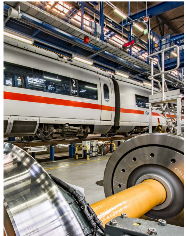
Maintenance Facility Photos Courtesy of Deutsche Bahn AG