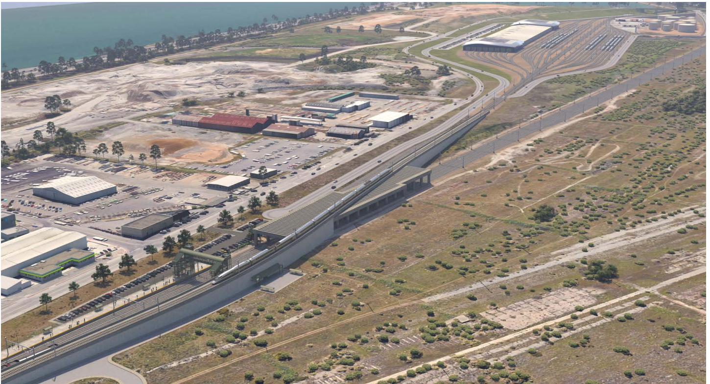
Conceptual Rendering: Light Maintenance Facility (Brisbane, California)

Three Light Maintenance Facilities (LMFs) located along the system will provide regular maintenance and operations for high-speed trains. LMFs are where trains are inspected, cleaned, serviced and stored, providing a service point for any trains in need of emergency repair services. LMFs will also supply trains and crews to the local terminal station at the start of the day. Between 125 to 150 jobs will be located at these three facilities, including mechanical technicians, cleaners and inspectors.