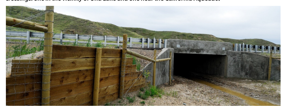
Combined Undercrossing/Drainage Culvert and Wildlife Jump-Out

Based on the evaluation in the Wildlife Corridor Assessment, the Authority designed a mitigation measure that requires the installation of two dedicated wildlife crossings: one in the vicinity of Una Lake and one near the California Aqueduct