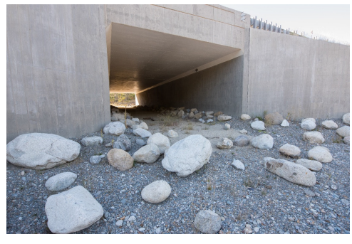
Typical Wildlife Undercrossing

Other examples of the Authority's efforts on the Palmdale to Burbank section include: