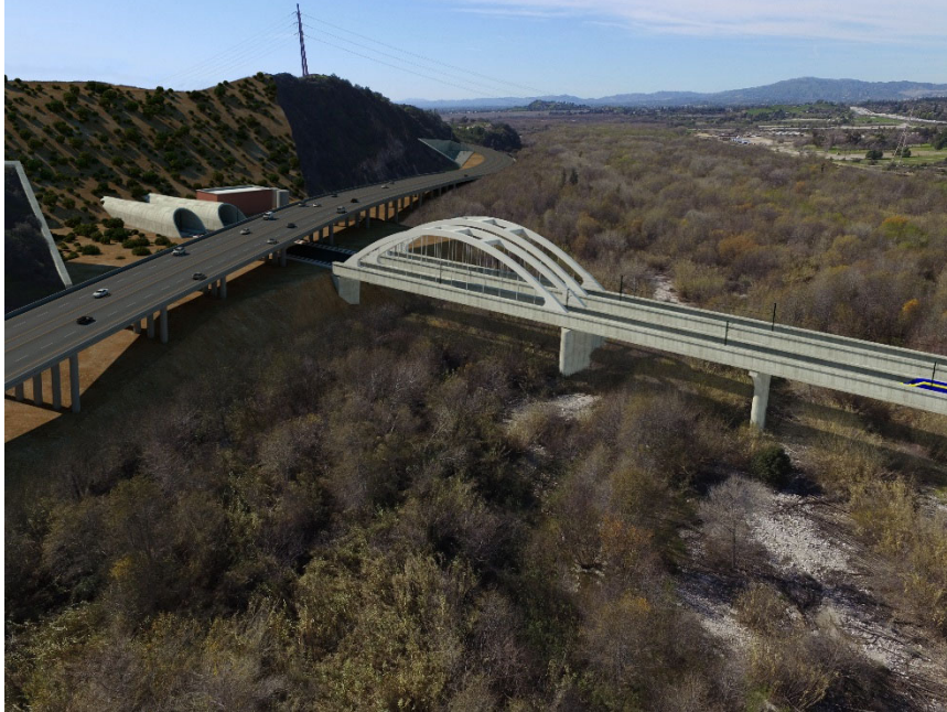
Figure 1. Proposed Design Change - Elevated Wentworth Street