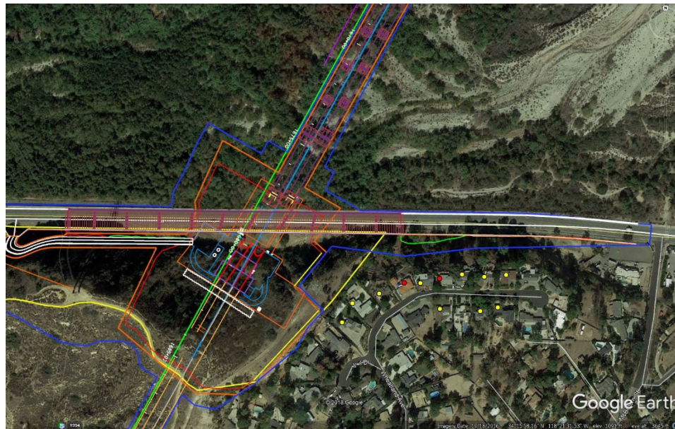
Figure 3. Location of Predicted Noise Effects

Figure 3, below, shows the location of predicted noise effects. Note that there is no difference to the predicted noise effects due to the design change as compared to the original noise assessment.