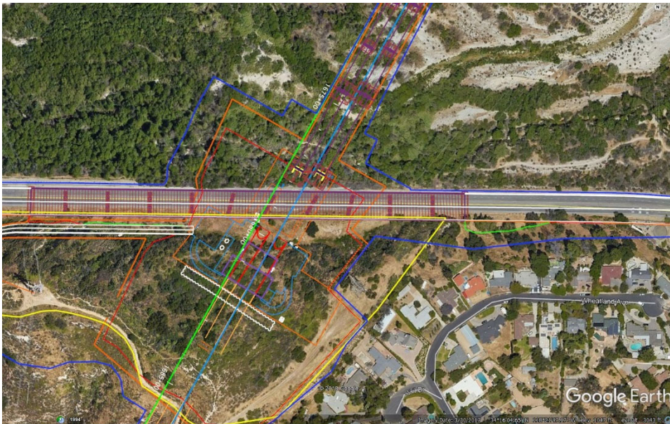
Figure 2. Proposed Design Change – Nearby Noise-Sensitive Receivers

CSA analyzed the change in noise due to the proposed design change and determined that: