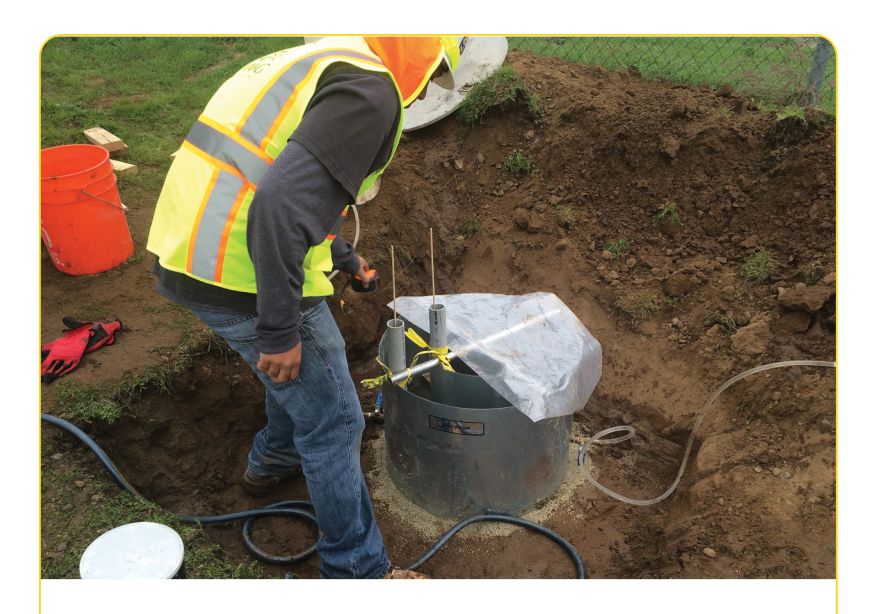
Disabled Veteran Business Enterprise Moore Twining conducted procedures known as infiltration testing as part of our permitting agreement with the State Water Quality Control Board. The testing included sensors which measured the rate at which water is absorbed into the ground as part of work on CP 1.

million the Authority has budgeted for Central Valley farmland mitigation. Initial applications were due in February 2015.