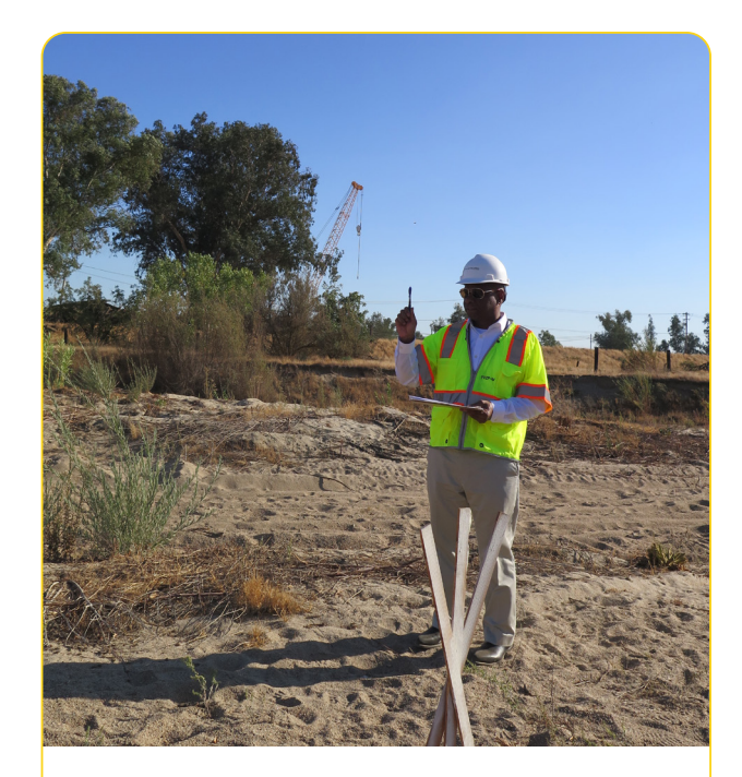
Even before the bridge at the Fresno River near the city of Madera begins to take shape, pre-construction, including geo-technical investigations, had been underway since June 2014. Throughout the summer and up to Thanksgiving, the Authority's design-build contractor TPZP conducted a series of tests to help finalize design work to prepare for the actual construction of the bridge anticipated to begin later in 2015.

Also in November 2014, the Authority and the California Department of Conservation (DOC) announced the solicitation of farmland mitigation proposals in Fresno and Madera counties in support of the Authority's CP 1 mitigation requirements. This program is being managed by the DOC and is part of the $20