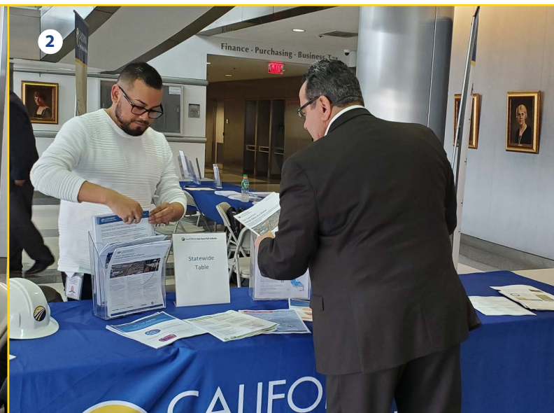
1. The three shortlisted teams bidding on the Track & Systems contract attended an Industry Forum in Fresno. They're looking for small businesses to meet a 30 percent participation goal and explained the first portion of the contract is worth about $1.6 billion.