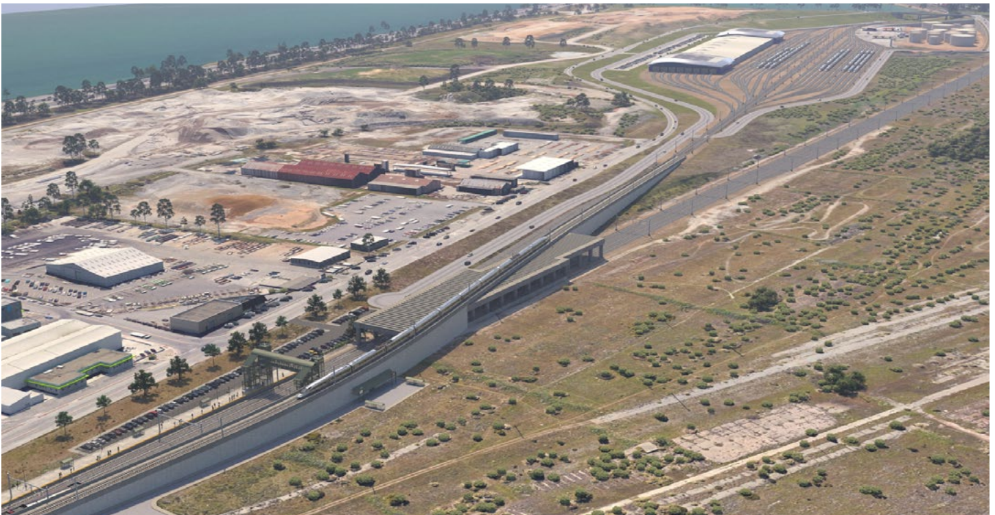
Conceptual Rendering: Light Maintenance Facility (Brisbane, California)

Three Light Maintenance Facilities (LMFs) located along the system will provide regular maintenance and operations for high-speed trains. LMFs are where trains are inspected, cleaned, serviced and stored, providing a service point for any trains in need of emergency repair services. LMFs will also supply trains and crews to the local terminal station at the start of the day. Between 125 to 150 jobs will be located at these three facilities, including mechanical technicians, cleaners and inspectors.