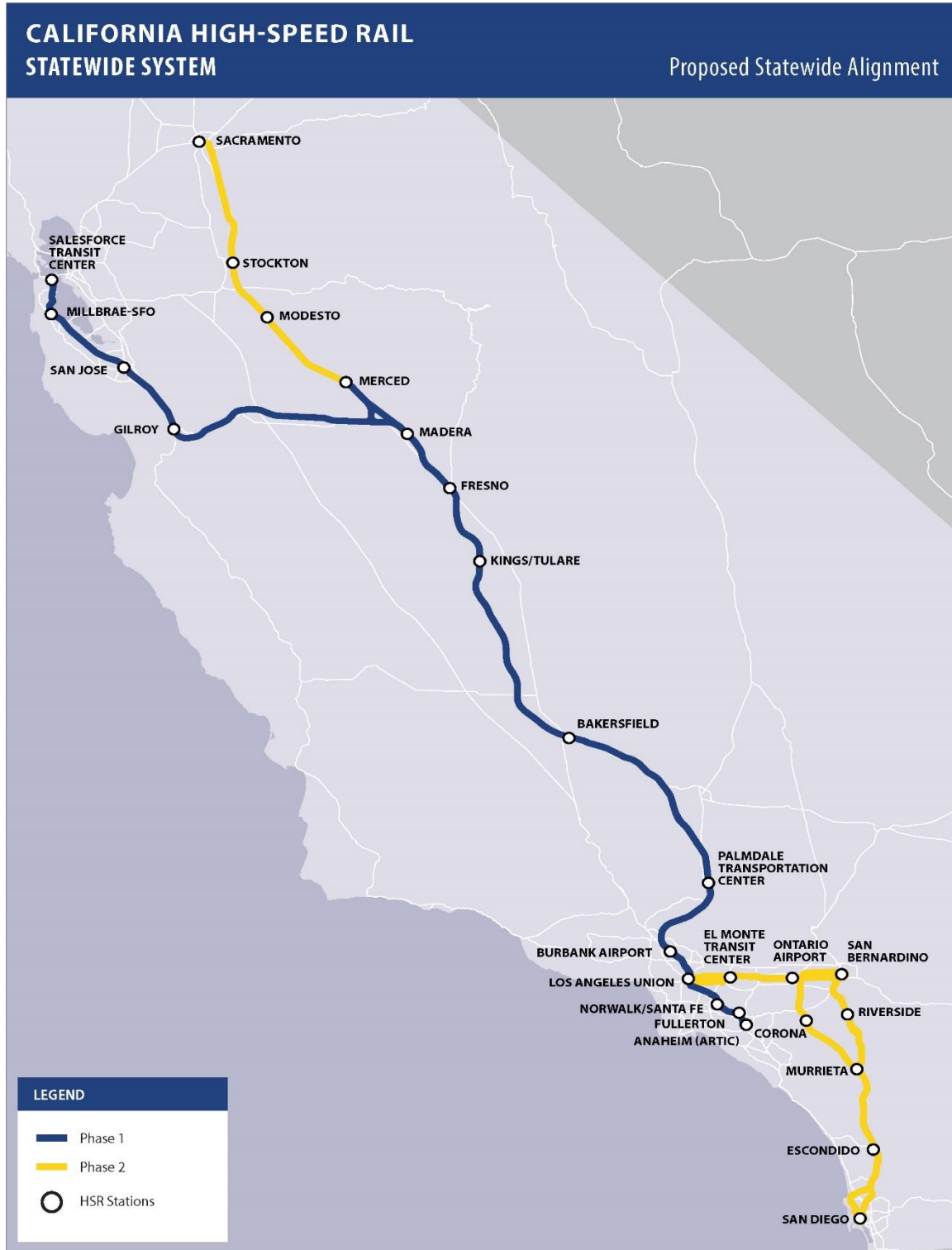
Figure 1 California High-Speed Rail Statewide System