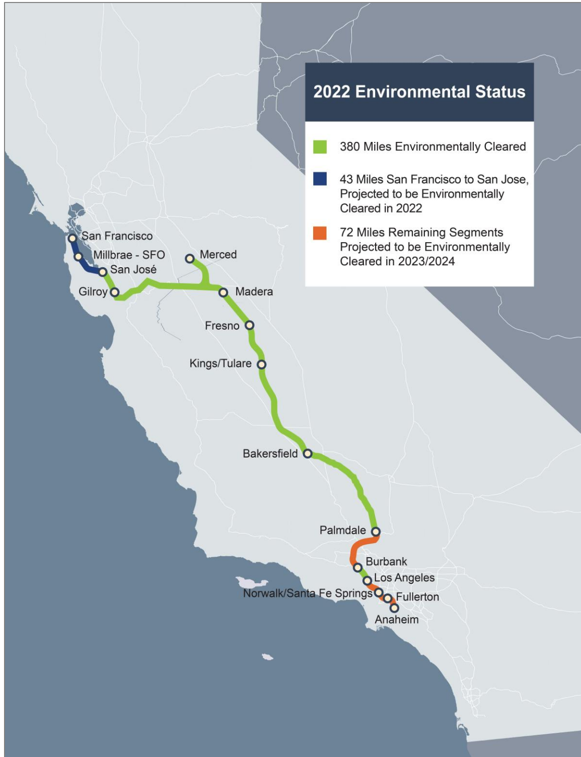
Figure 3 Map of Environmental Document Status and Progress