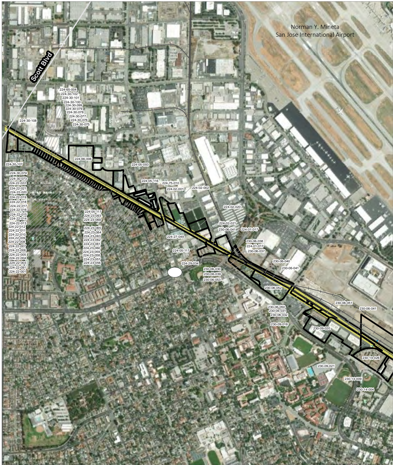
PRELIMINARY DRAFT/SUBJECT TO CHANGE - HSR ALIGNMENT IS NOT DETERMINED SOURCE: ESRI, 2019; Santa Clara County, 2016; San Mateo County, 2016, San Francisco County, 2016