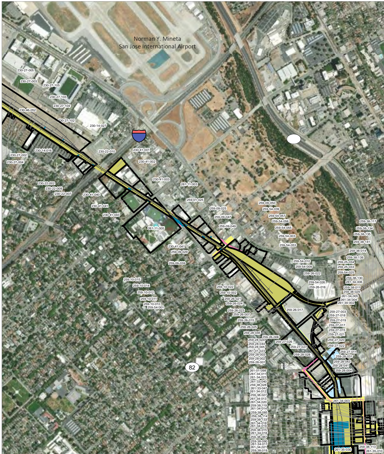
PRELIMINARY DRAFT/SUBJECT TO CHANGE - HSR ALIGNMENT IS NOT DETERMINED SOURCE: ESRI, 2019; Santa Clara County, 2016; San Mateo County, 2016, San Francisco County, 2016