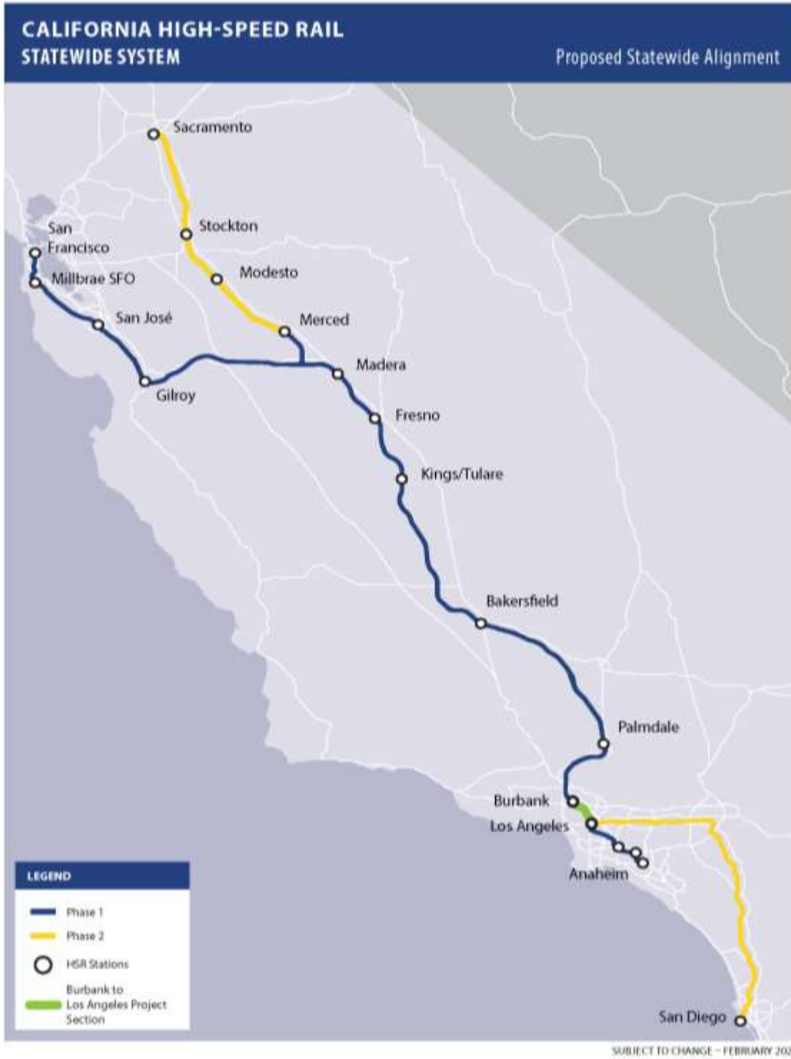
Figure 1 California HSR System