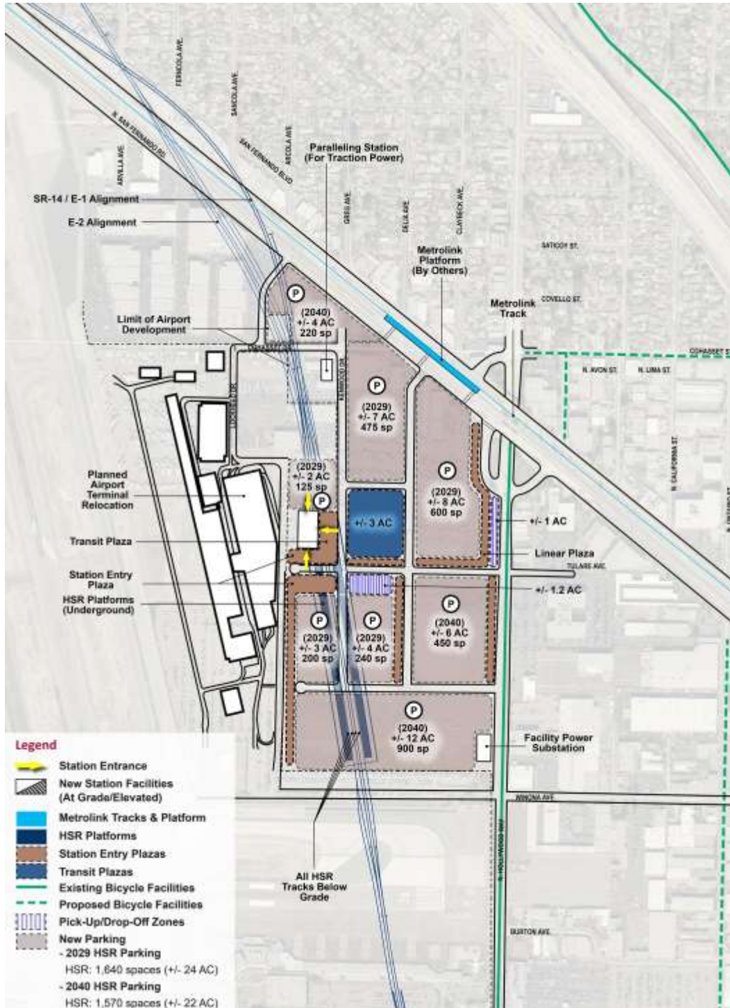
Figure 3 Burbank Airport Station