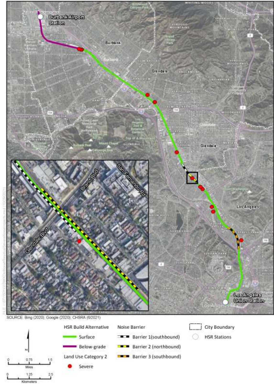
Figure 5 Residual Severe Noise Impacts